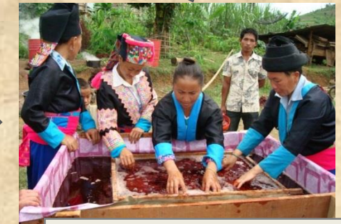
6. Whirl the pulp around with fingers