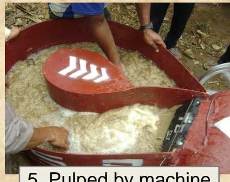
5. Pulped by machine or Hand